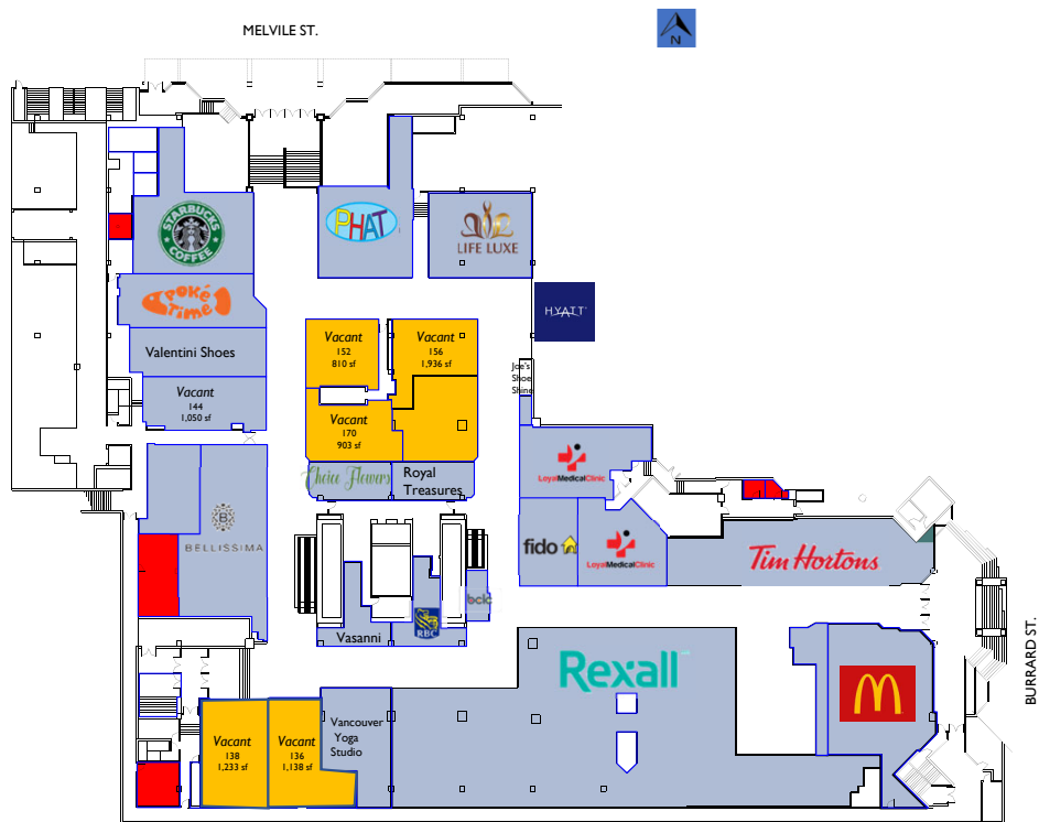
R1 - Upper